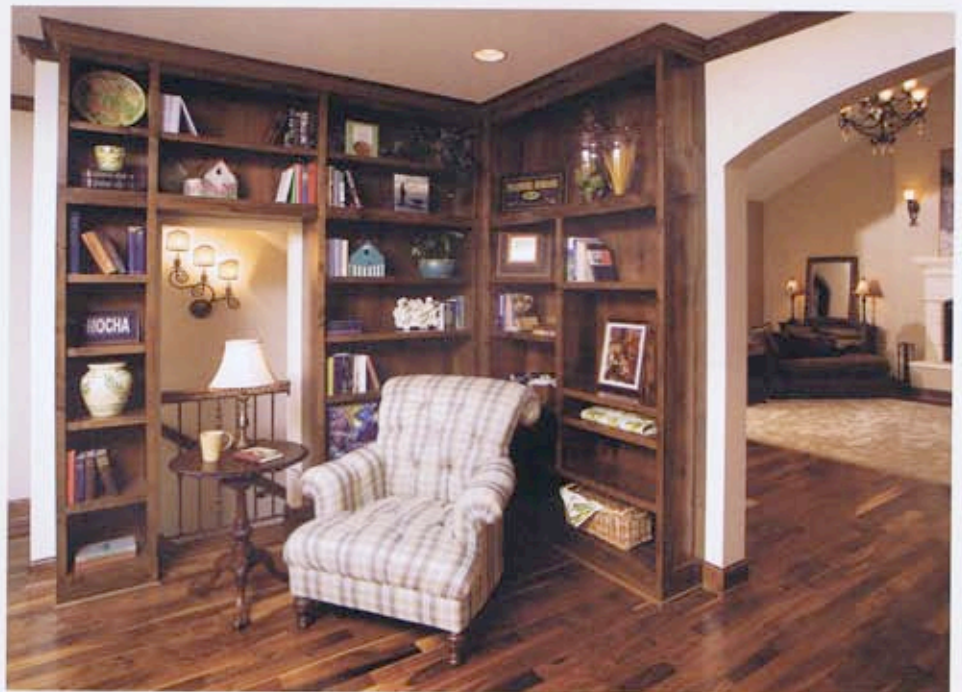
The cozy library nook adjacent to the kitchen, provides a quiet spot for a relaxing cup of coffee, while giving a glimpse into the Old-World styled living room.