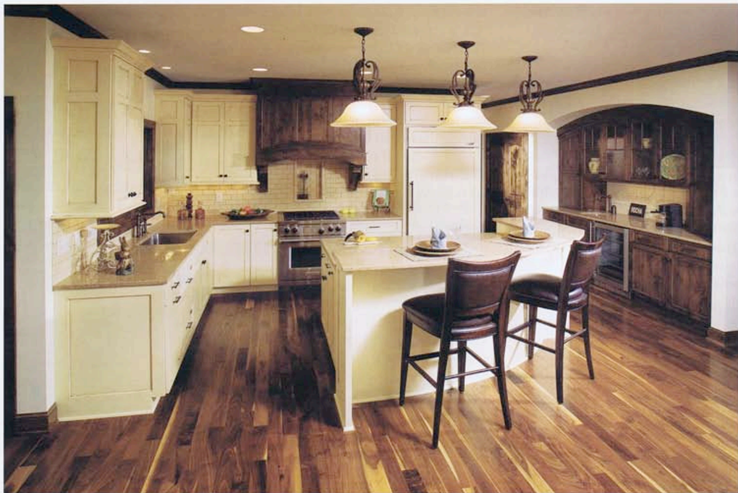
The antiqued painted cabinetry of the kitchen and quartz countertops are complimented by the knotty alder buffet and range hood, both displaying the distinctive Roman arch reflected throughout the home.