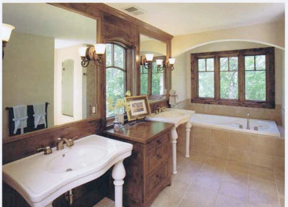
The Roman arches prevalent throughout the home, add grace and elegance to the master bath.