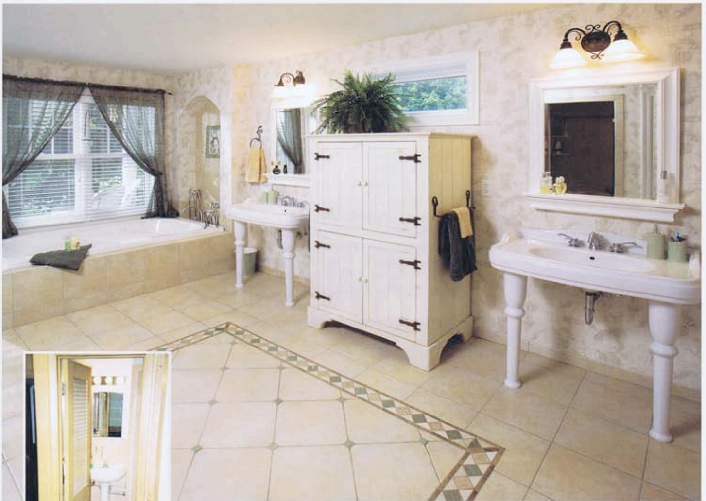
A closet-sized bathroom was transformed into a luxurious bathroom suite.