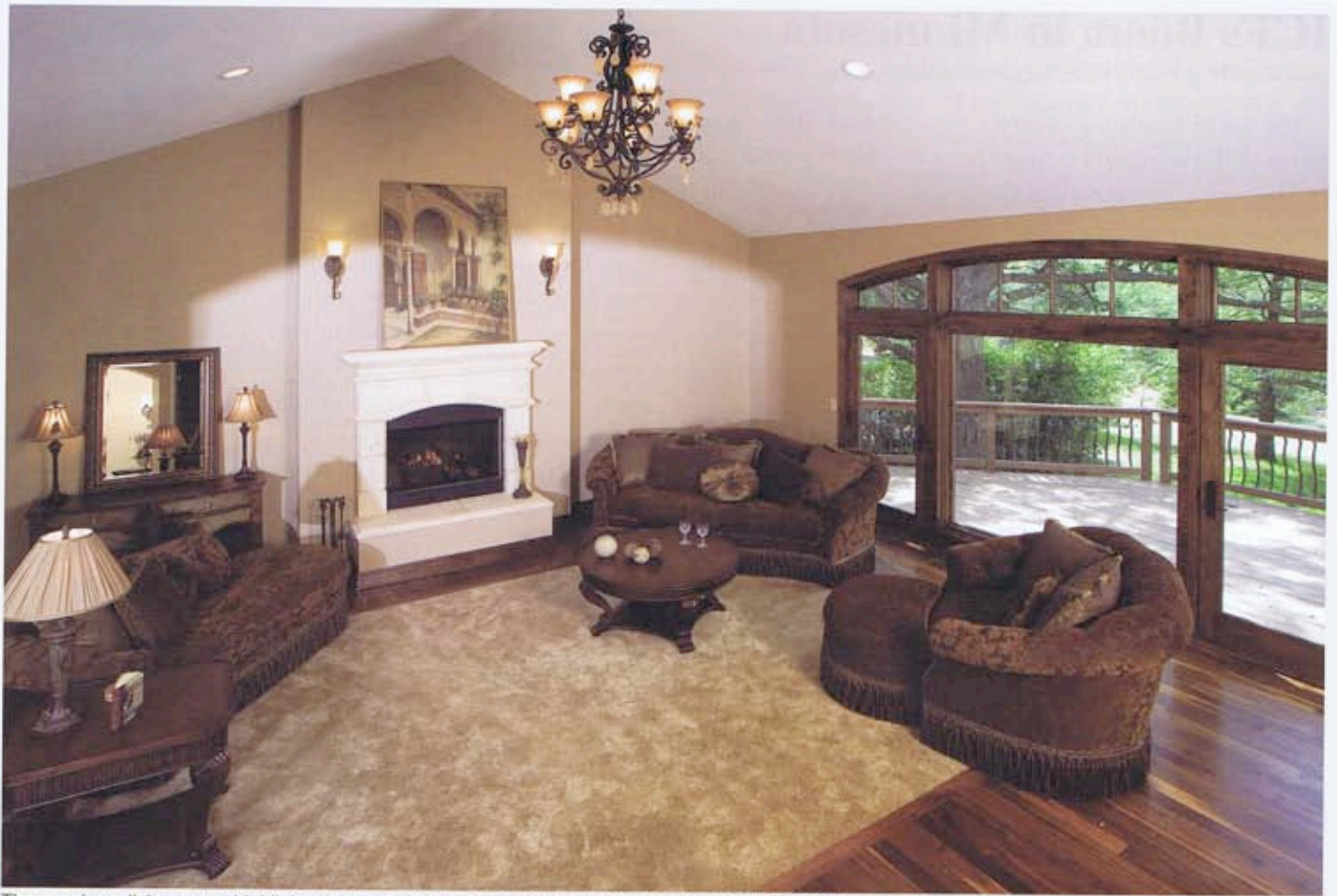
The spacious, living room, highlighted by a stone fireplace and walnut floors, overlooks the private wooded lot.

to begin her own company when the bank manager remembered her, and inquired into what she was doing. As it turns out, her new endeavor struck a chord with the bank manager who referred her to her first remodeling job, thus launching Home Reflections.