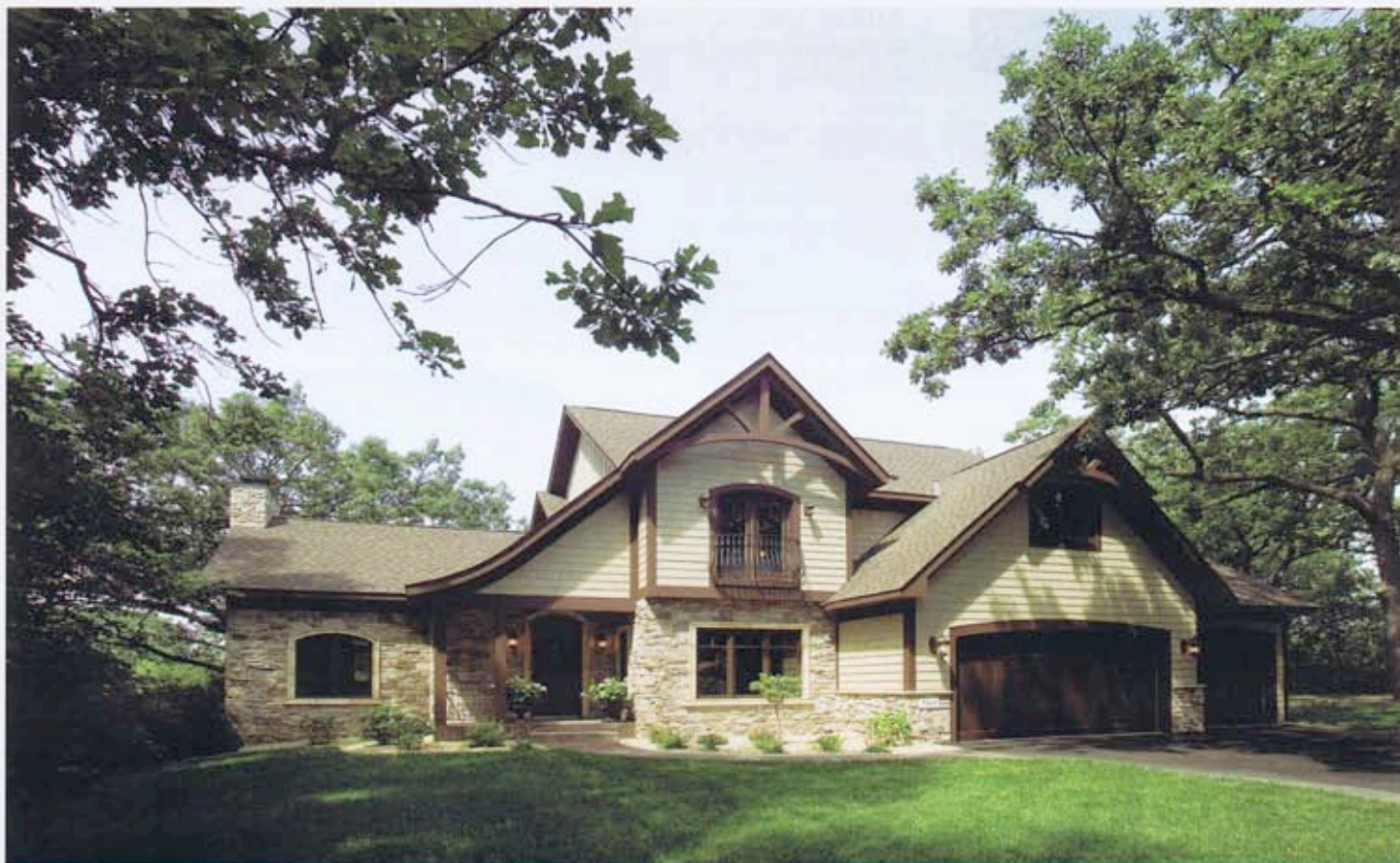
This European-style villa combines the charm of yesterday with all of the amenities of today.