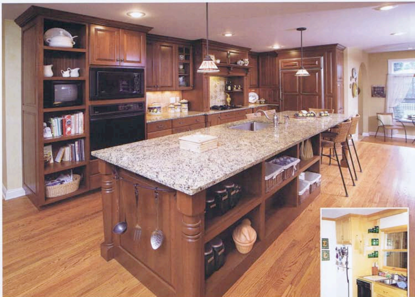
A small and cramped area became a gorgeous kitchen when a wall was removed and the area was remodeled.