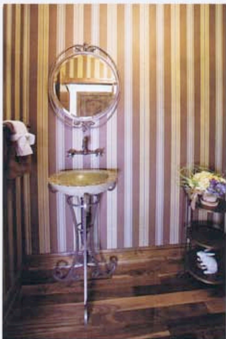
Distinctive features like this concrete basin are evident through the home.

communication with subcontractors is very important to ensure the building process is a success. Teresa Elsbernd is a builder with an eye for the finishing touches that will make each home unique.