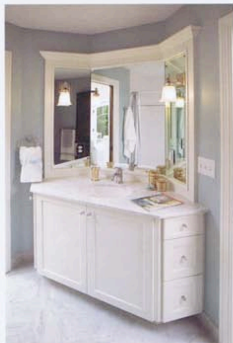
A custom-designed, beveled vanity highlights the unique angles of this bathroom while giving a glimpse of the adjoining bedroom and balcony.